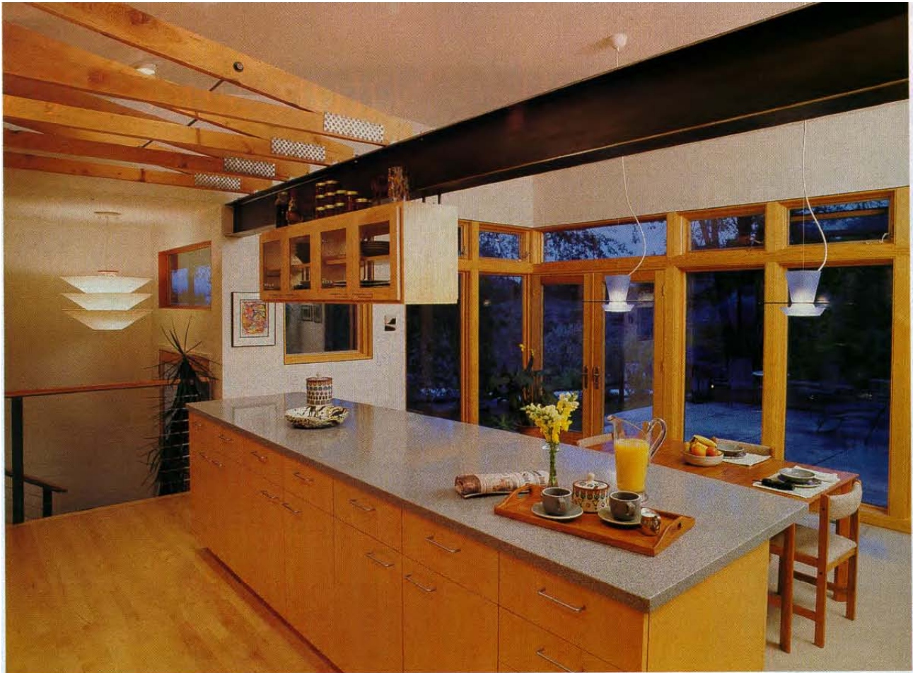
THIS ADDITION CREATES a strong connection to the new patio—even from the rear of the kitchen, the eye is drawn to the garden terrace.